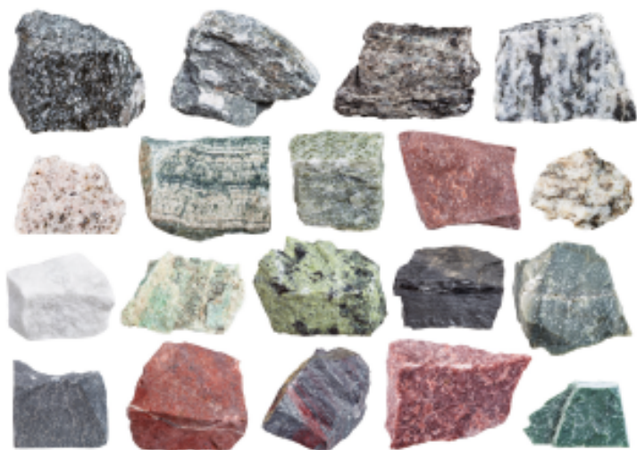
Collection of metamorphic rock specimens.