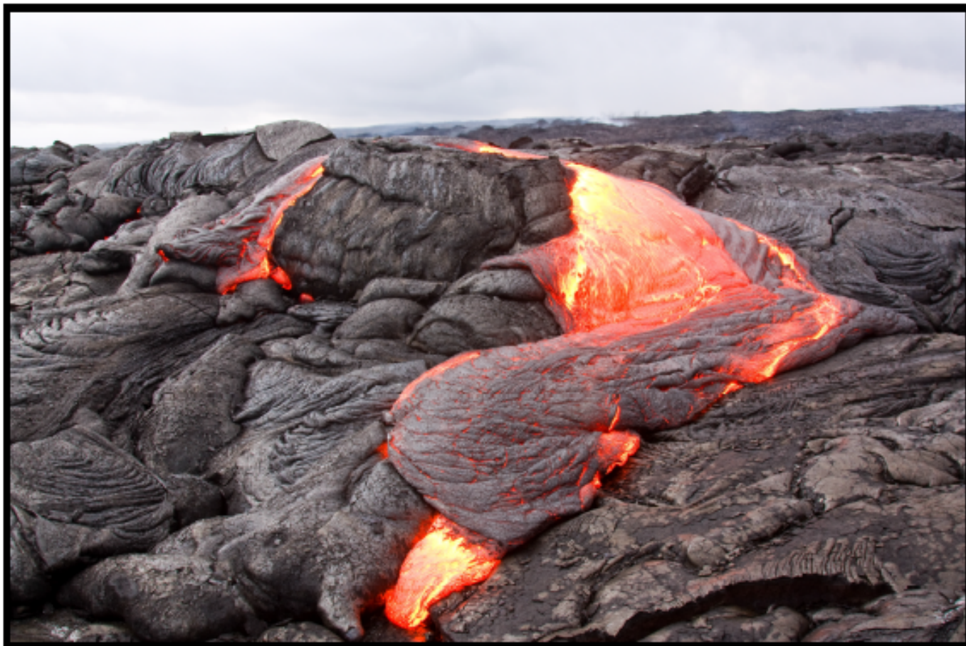
Lava flow from active volcano creates igneous rock.

Rocks are constantly being formed and broken down in the process of the rock cycle. Sedimentary rock today may be buried over time and subjected to extreme heat and pressure changing it into Metamorphic rock. The metamorphic rock may melt and eventually cool forming igneous rock. Over time, As the igneous rock is broken down through weathering, erosion may carry the sediment away where it will settle in layers forming sedimentary rock and the whole cycle begins again.